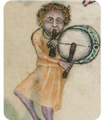
The Luttrell Psalter, British Library Add MS 42130 medieval manuscript, 1325