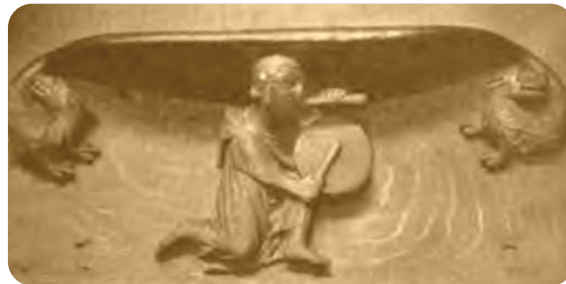
Image from article by Edith K. Prideaux. - The Archaeological Journal Volume 72. 2nd Series volume 22. London: The Council of the Royal Archaeological Institute of Great Britain and Ireland. (HORN AND DRUM EXAMPLE)