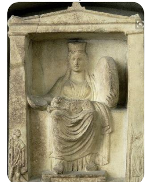
Goddess Kybele sitting with panther on lap, Hermes Kadmilos and Hekate on the pillars - at the Pergamon Museum, Berlin