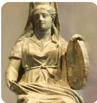
Goddess Cybele, Found in Rome, circa 2nd century CE. Metropolitan