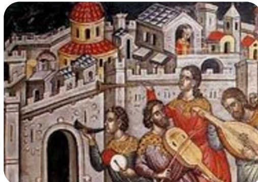
Monastery Stavronikita, Athos. Part V (HORN AND DRUM EXAMPLE)