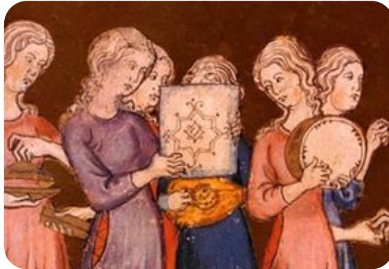
Miriam and Israelite women celebrate the Exodus from Egypt