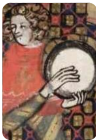
1338-44, French. From The Romanace of Alexander; fol 127v Musician with diagonally striped cotehardie, black belt, shoes and pouch, parti-colored hose